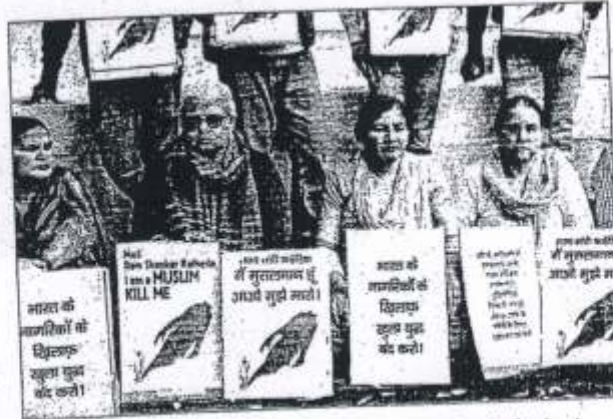
People protest against Union minister Ram Shankar Katheria at Jantar Mantar in New Delhi on Tuesday.

"What has been published in one of the newspapers is false. I had not taken the name